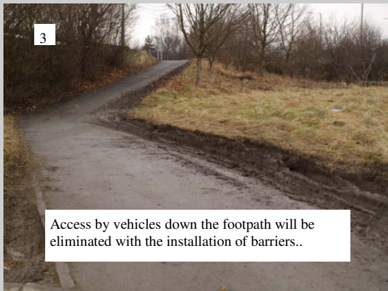
Access by vehicles down the footpath will be eliminated with the installation of barriers..