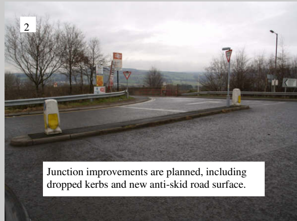
Junction improvements are planned, including dropped kerbs and new anti-skid road surface.