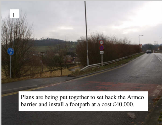
Plans are being put together to set back the Armo barrier and install a footpath at a cost £40,000.